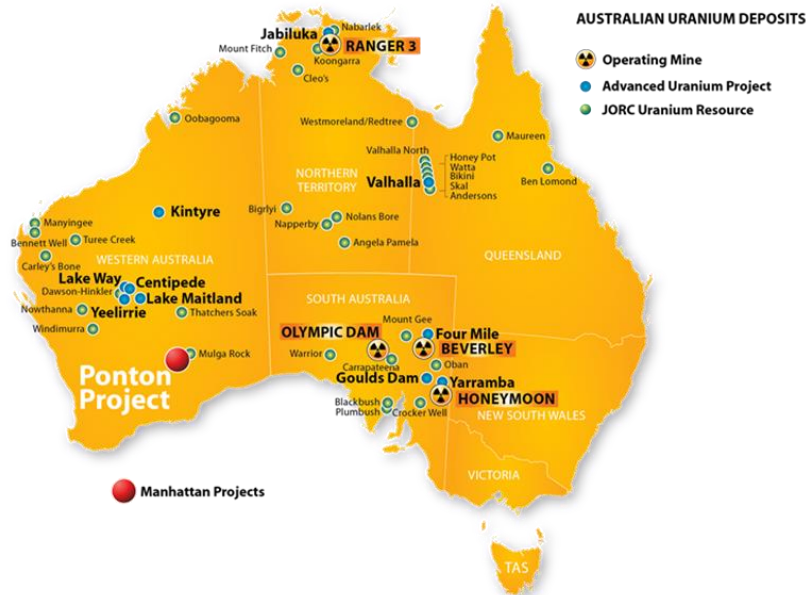
Figure 1: Ponton Project Location

Manhattan's Ponton uranium project is located approximately 200 km northeast of Kalgoorlie (Figure 1) on the edge of the Great Victoria Desert in WA. The Company has 100% control of around 460km 2 (Figure 2) of exploration tenements underlain by Tertiary palaeochannels within the Gunbarrel Basin. These palaeochannels are known to host a number of uranium deposits and drilled uranium prospects (Figure 2).