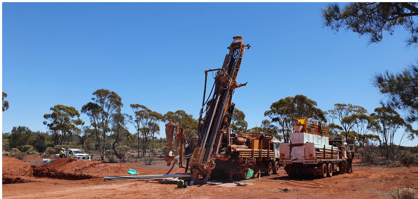
RC rig set up for drilling at Omrah nickel prospect