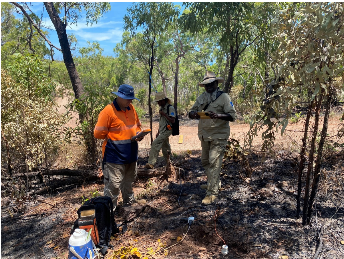
Image 1. DDIP technician accompanied by Kaurareg Native Title Aboriginal Corporation (KNTAC) representatives. Photo taken recently at Horn Island.

Approved by the Board of Alice Queen Limited.