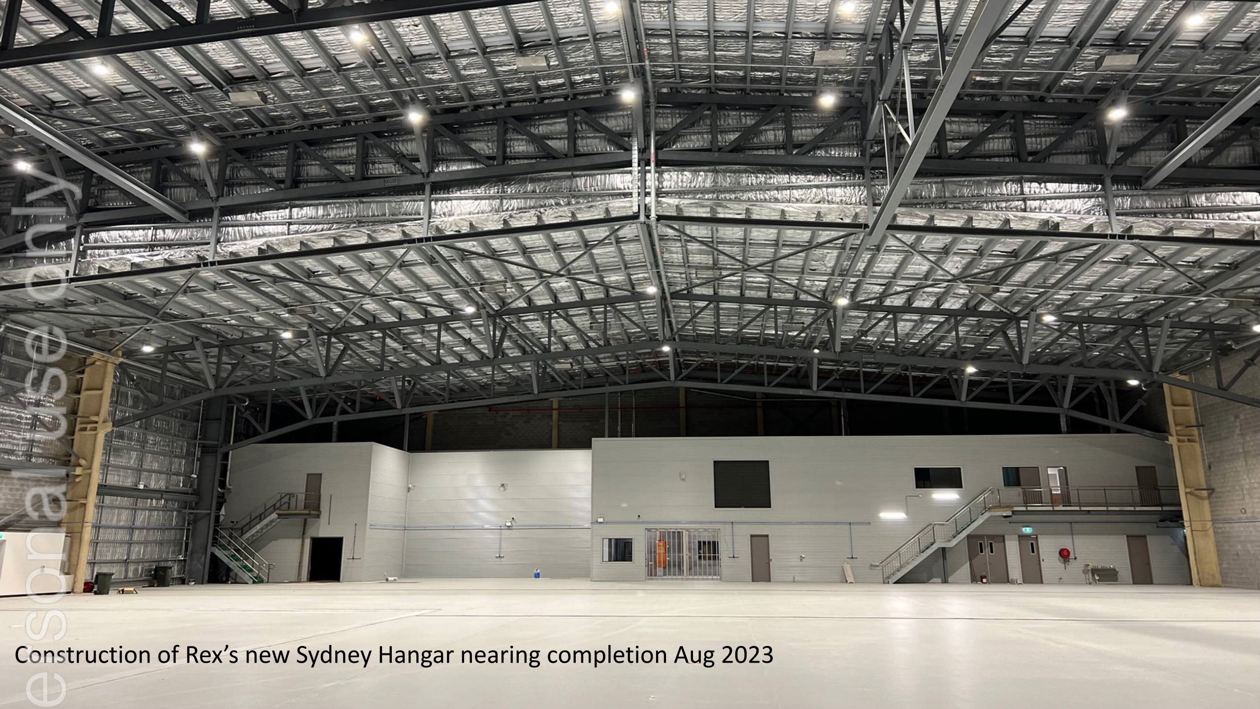
Construction of Rex's new Sydney Hangar nearing completion Aug 2023