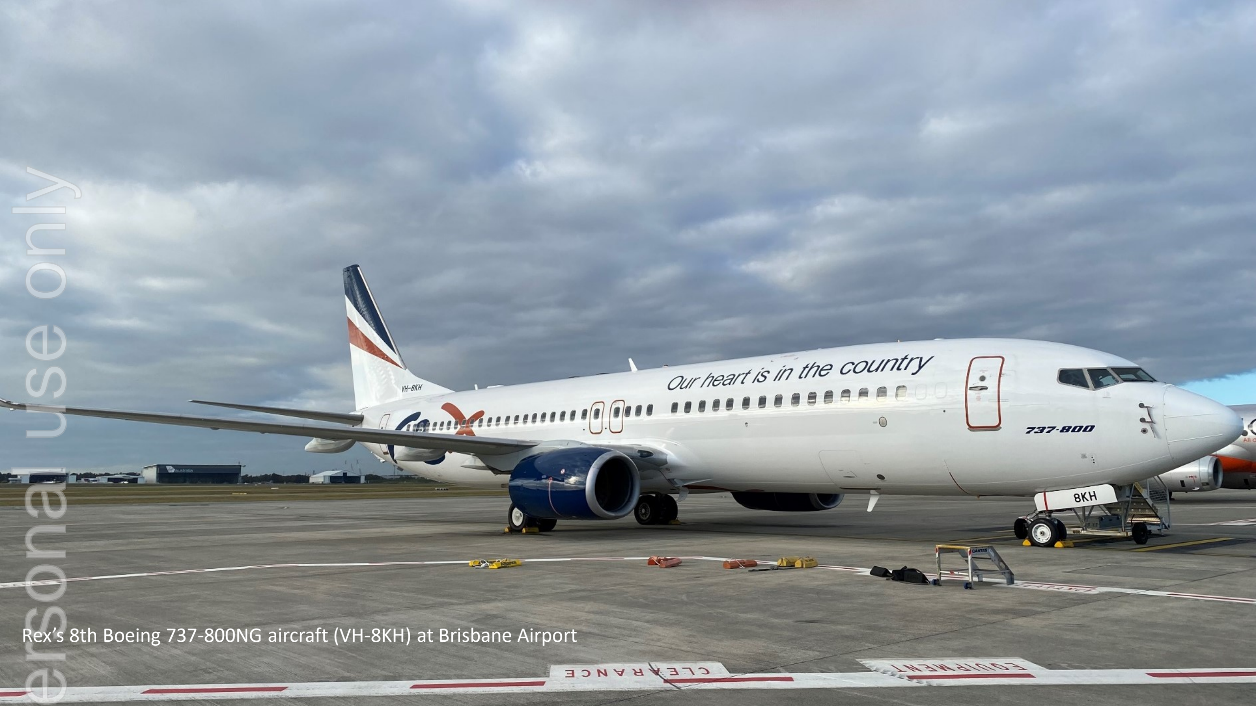
Rex's 8th Boeing 737-800NG aircraft (VH-8KH) at Brisbane Airport