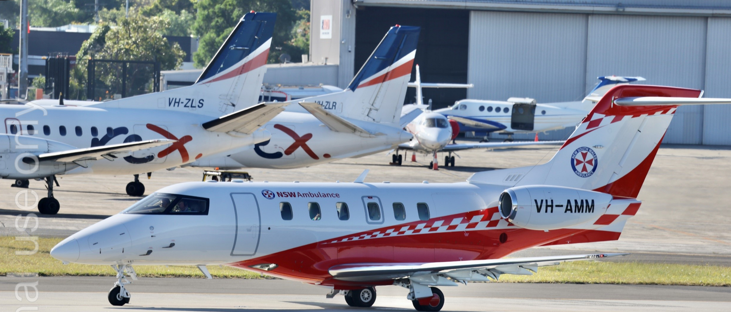
Pel-Air's brand new Pilatus PC24 jet aircraft at Sydney Airport in April 2023