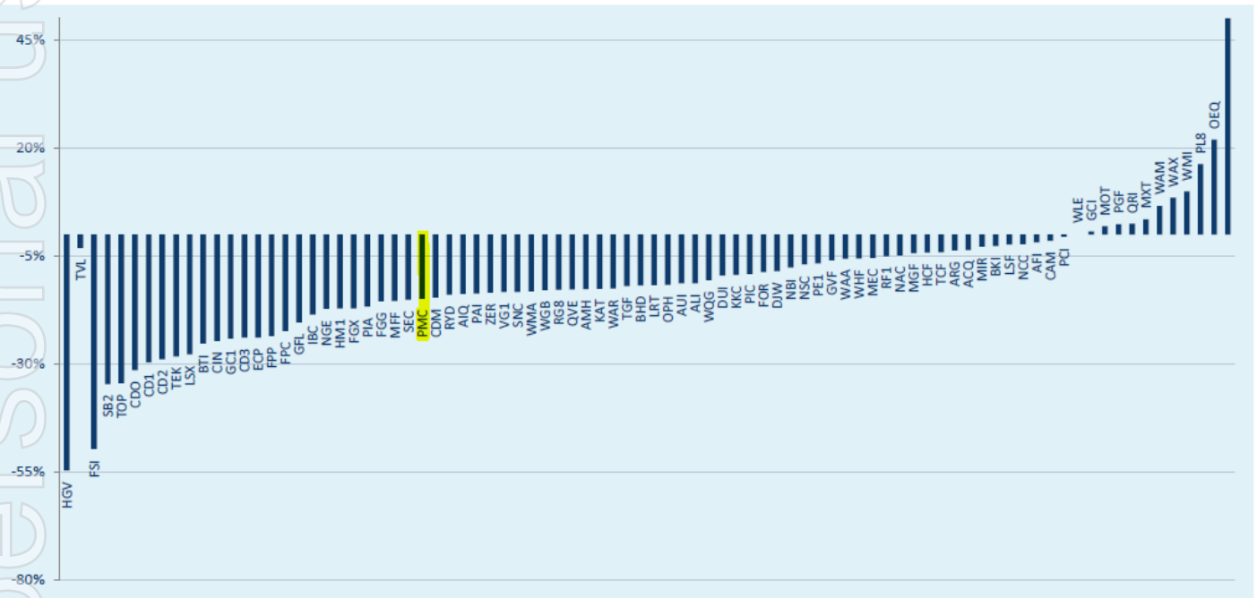
LICs Premium / Discount to NTA as at 29 December 2023