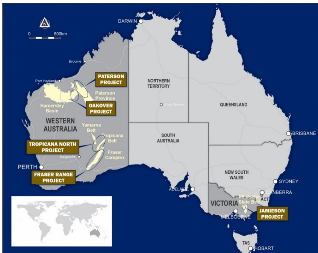
Figure 1: Location of Carawine's Projects throughout Australia.

The Company has five gold, copper and base metal exploration projects, targeting high value deposits in highly prospective, active mineral provinces in Western Australia and Victoria (Figure 1). Part of Carawine's assets located in Western Australia are held by its wholly owned subsidiary, Phantom Resources Pty Ltd.