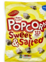
Food grade packaging with 35% recycled content