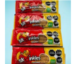
Customer transition to AmPrima™ recycle ready structure