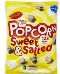
Food grade packaging with 35% recycled content