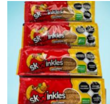
Customer transition to AmPrima™ recycle ready structure