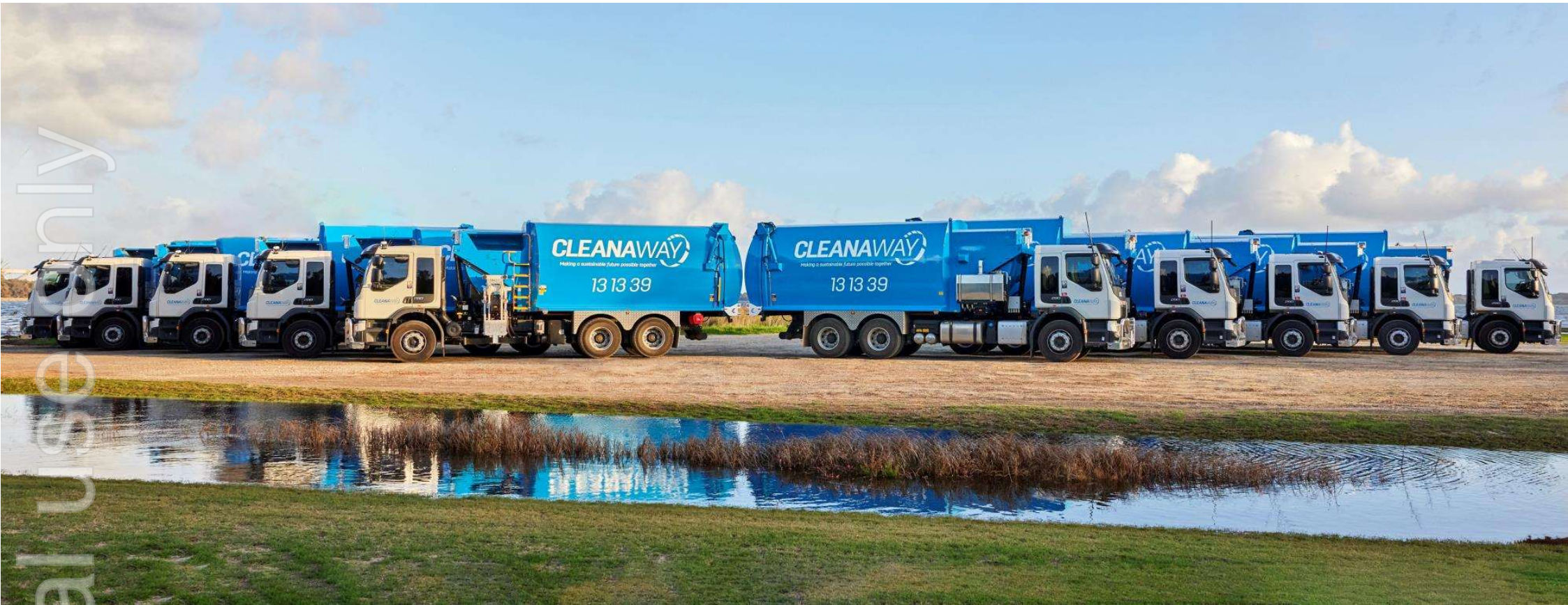
Pictured: Cleanaway Southwest Western Australia fleet