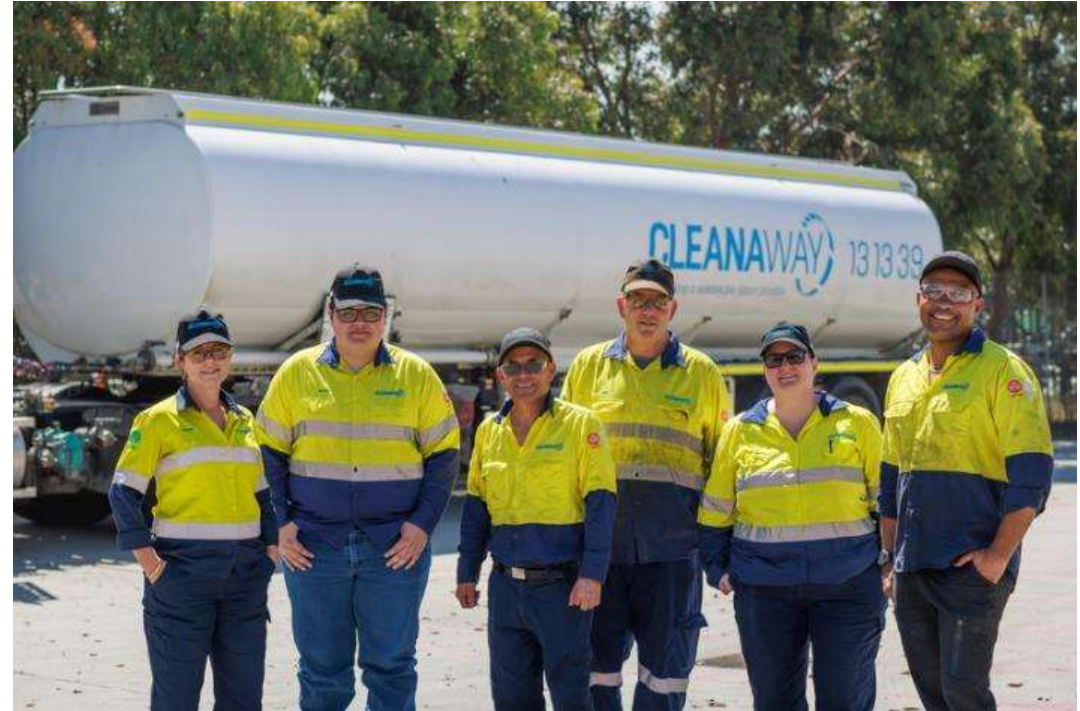
Pictured: Dandenong Hydrocarbons facility team