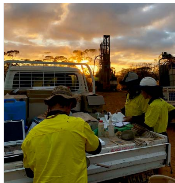
Figure 2 - Drill rig at T8 prospect