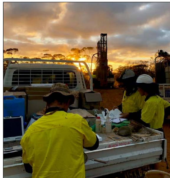
Figure 2 - Drill rig at T8 prospect