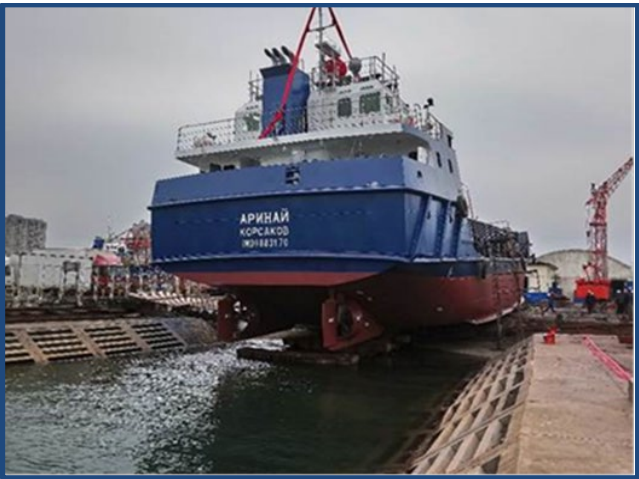
Launching of the “Arinay” 500t barge for sea trials on 20 April

The Company continues to invest in operating capacity, particularly in enhancing port throughput capabilities. In the March 2019 quarter, the construction in China of two 500t barges contracted in 2018 continued, the barges launched for their sea trials in April. Their delivery to Beringovsky port and final commissioning is expected to be completed in the first half of the 2019 shipping season.