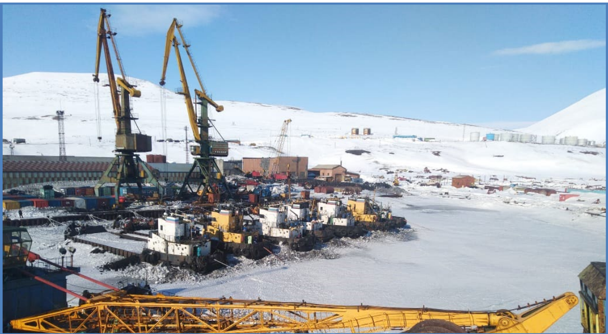
Beringovsky port 17 April 2019

TIG commenced a range of preparatory works to ensure its capacity to utilise any weather-related shipping opportunities which may arise should the ice thaw arrive earlier than expected. Accordingly, planned port infrastructure works commenced, including the general inspection, testing, repair and maintenance of all onshore infrastructure. Specific works on sea wall strengthening and coal pier repairs also began, this work programme is currently on track to be completed in readiness for the 2019 shipping season.