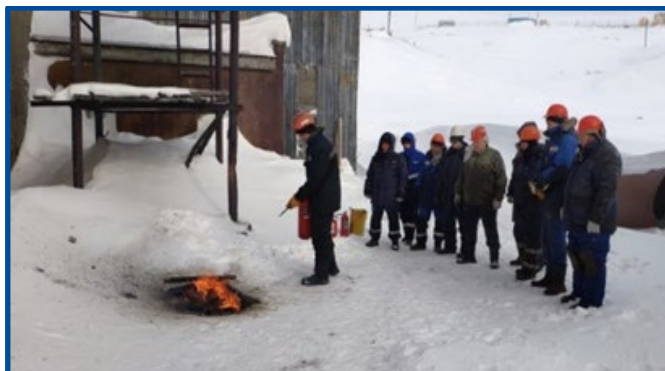
Demonstration of fire management drills