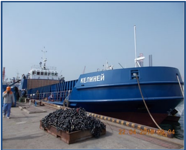
The “Keliney” 500t barge ready for sea trials on 20 April