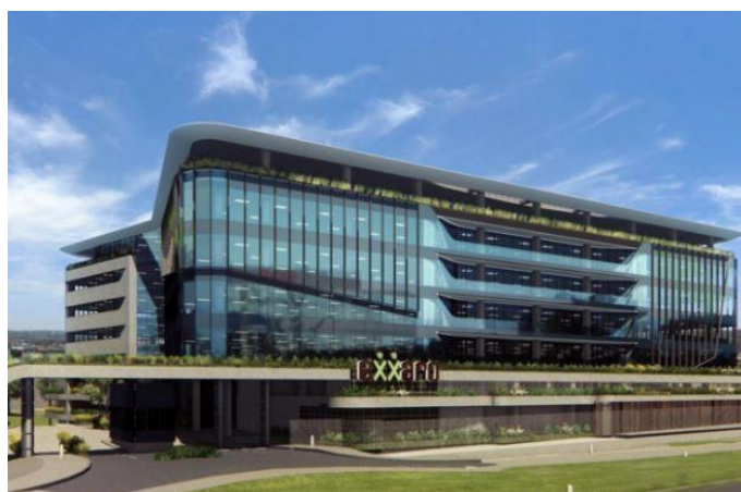
Artists impression of new Exxaro office at West Street, Centurion, Pretoria

GrowthPoint are to integrate the purchased panels into a project they have been completing for prominent South African mining company Exxaro, in Centurion, Pretoria, South Africa. The project was completed in conjunction with green building electrical engineering consultants Conscius Consultants, who will assist with the implementation of the ClearVue PV innovation solution into the new building.